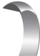
D Shape Flat